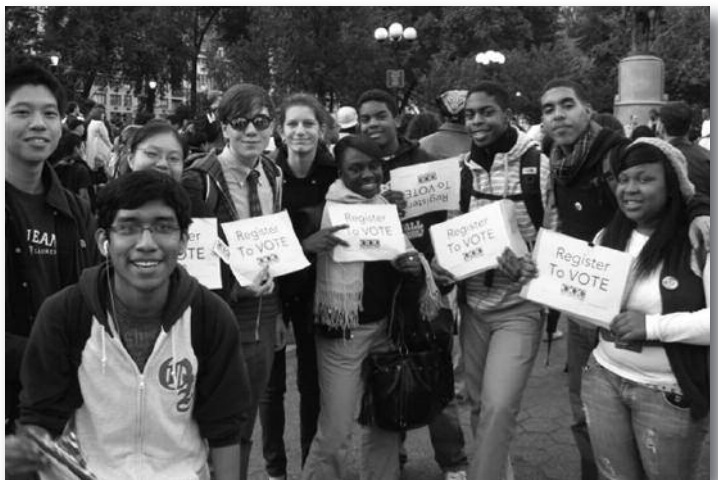
YouthAction students encourage voter registration.

The Youth Community Leadership Course (YCLC) engaged 48 public and private high school students over the fall and spring semesters. Students examined youth development programs and access to healthy affordable food in three communities—Mott Haven, East Harlem, and the Lower East Side. Through reviews of literature and data, street administered public opinion polls, site visits, and meetings with elected officials and community leaders, students identified community needs and barriers, developed recommendations, and mapped out opportunities to advocate for children and youth. Alumni of the YCLC can join CCC's YouthAction Members (YAMS) and this year 30 YAMS focused on 3 activities related to civic youth engagement. First, YAM- led voter registration activities led to the registration of 195 new voters prior to the fall Presidential election. Second, to measure interest in and access to civic engagement activities among YCLC alumni and New York City youth, YAMS developed and administered surveys. Over 200 surveys have been completed to date. Survey results will not only inform CCC's youth leadership programming but also our advocacy for youth development, after school, and educational programming. Finally, 12 peer trainers provided "youth leadership and advocacy" workshops in 14 different settings this academic year, engaging over 540 youth in the development of school and community based youth advocacy plans.